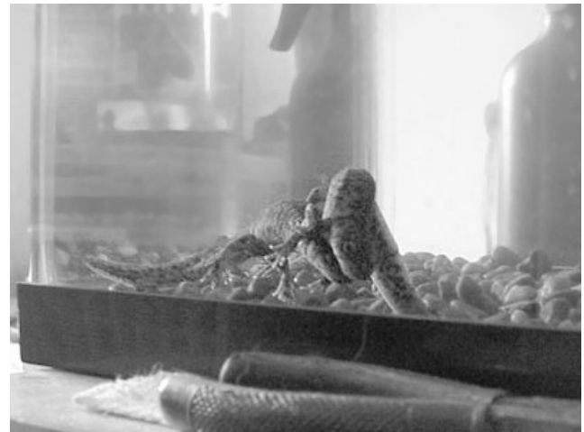
Pleurodeles waltl , adults in amplexus, photo © Jessica J. Miller, http://www.livingunderworld.org

Adult males generally possess longer and more laterally compressed tails than females, however, this may be difficult to determine in all cases. During the breeding season, males develop black nuptial pads on the insides of the front legs, and often display a reddish-orange hue along the body. Sexual dimorphism is very subtle, and sometimes the only way to tell the males from the females is to actually see them in amplexus, for which the male always amplexes the female from below. Juveniles will also begin amplexing one another at a fairly young age, sometimes at less than a year old, although fertile eggs are rarely produced at this age.