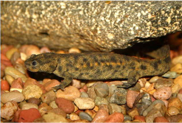
Pleurodeles waltl