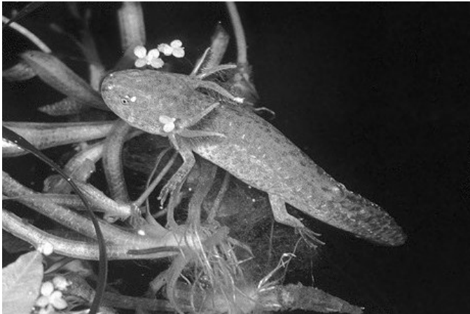
Pleurodeles waltl

Eggs and larvae should be kept around 69°F- 72°F to simulate the summer temperatures in the wild. After metamorphosis, the young are mostly aquatic, like the adults, but may leave the water periodically for short periods of time. The coloration is identical to the adult pattern. New morphs grow very quickly when fed often, and can reach close to adult size in less than one year.